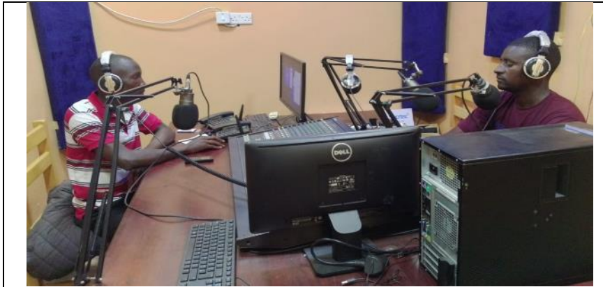
Project team sensitizing the community about the relevance of male involvement in MHM issues on the 3/April/2023

In Wakiso , a one hour talk show was conducted at Voice of Kiryagonja on the 6/April/2023 beginning from 7:00pm to 8:00pm in the evening. The participants included the Executive Director, projects manager and the Secretary for women Kiryagonja where the community was taken through the project overview and the achievements attained so far. Emphasis was put on the proper disposal of material used during menstruation and the availability of reusable sanitary pads at the Happy pad promotion centre. The secretary for women informed listeners about the responsibility of parents towards their children with emphasis on a girl child. Parents were encouraged to take their children to school.