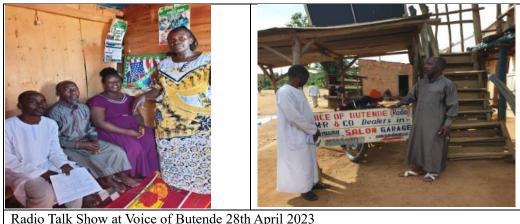
Radio Talk Show at Voice of Butende 28th April 2023

Community schools outside the target schools were called upon to prioritize menstruation hygiene. The team led by the team leader also reminded the community about the Happy Pad Promotion center and encouraged them to enrol for training program