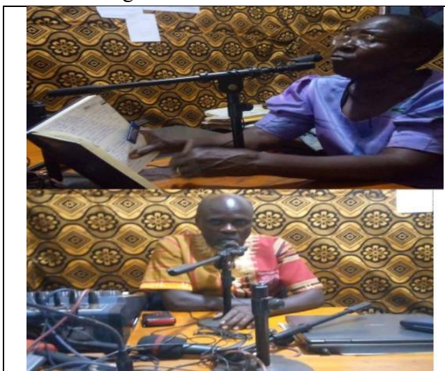
Radio talk show at voice of Kiryagonja

In Wakiso , a one hour talk show was conducted at Voice of Kiryagonja on the 6/April/2023 beginning from 7:00pm to 8:00pm in the evening. The participants included the Executive Director, projects manager and the Secretary for women Kiryagonja where the community was taken through the project overview and the achievements attained so far. Emphasis was put on the proper disposal of material used during menstruation and the availability of reusable sanitary pads at the Happy pad promotion centre. The secretary for women informed listeners about the responsibility of parents towards their children with emphasis on a girl child. Parents were encouraged to take their children to school.