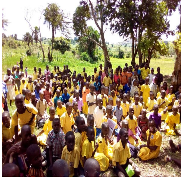
Pupils answering questions raised by the club