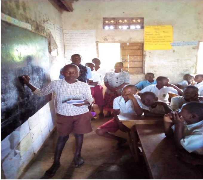
Kibalinga P/S MHM club conducting sex education training