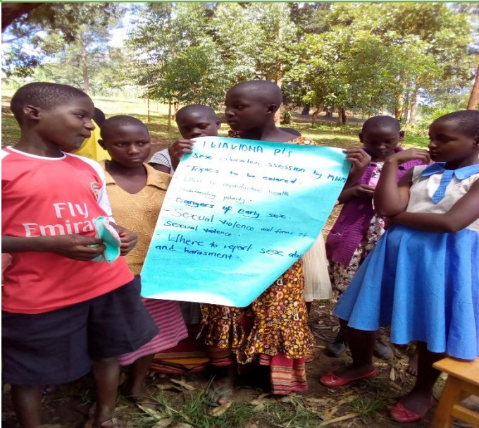
Sex education session going on at Lwawuna P/S by the club