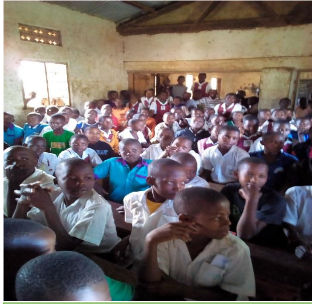
Pupils are so attentive