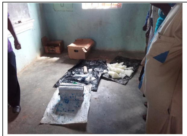
Material for candle making on display during the training while participants look on.