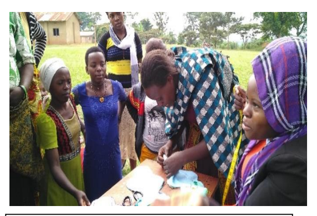
participants participate in sewing one at a go the training