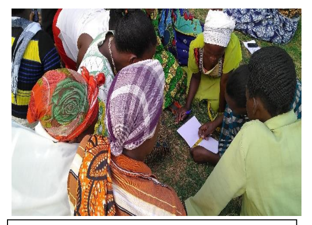
Representatives from each group take note