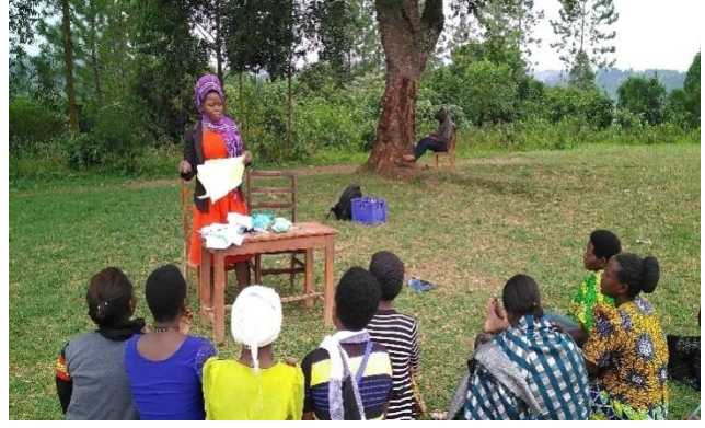
Babirye assembling materials