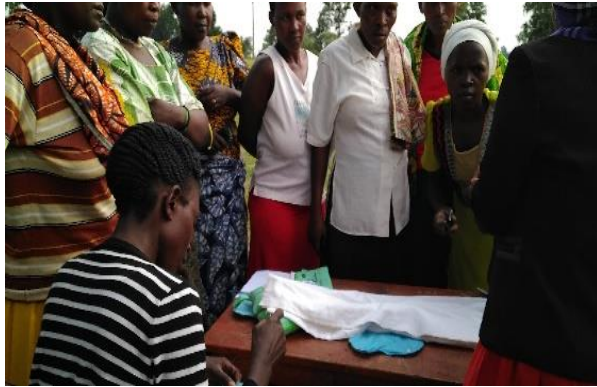
Provide questions to the SORAK trainers