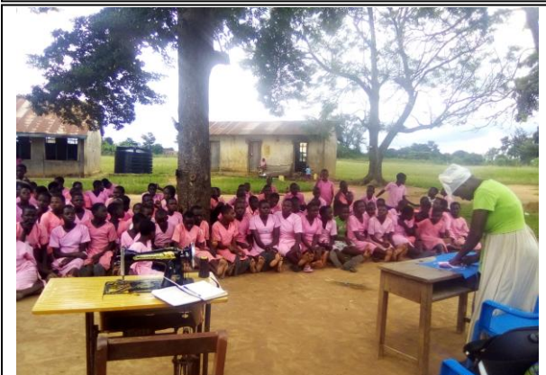
After making cuttings of the shape of a pad from the cotton cloth, a tailoring machine was used to sew the pad