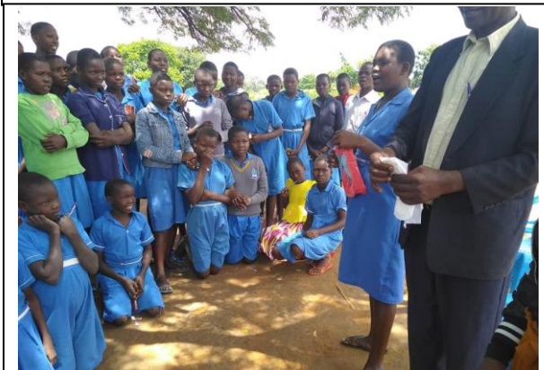
A pupil demonstrating how a pad is dressed on a knicker after making it