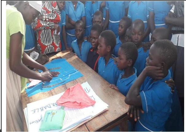
Demonstrating on how the reusable pad is cut to shape