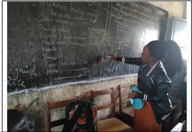
A facilitator explaining the various materials used in making reusable pads