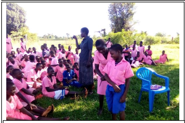
A boy offering support and demonstrating how a pad is worn