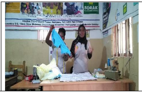
SORAK staff explaining the importance of each material in reusable pad making.