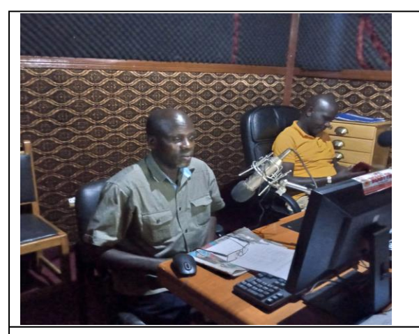
Executive Director SORAK introducing the reusable pad program schedule to the listeners of Heart FM

https://www.youtube.com/watch?v=q6OngzgBIIA&fbclid=IwAR1SWY0LbhYTdaU1Orcavob8Mdm1p8ukOYU5q8RnoVAQuhjVOPIA8Ub2ZkQ