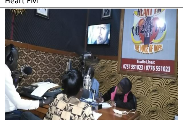
3 SORAK staff at Hart FM the voice of hope talking about MHM