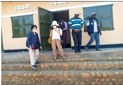
Team after visiting Luna FM