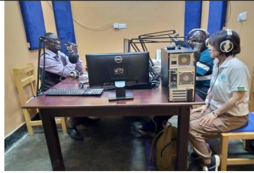
Members trying testing the microphone