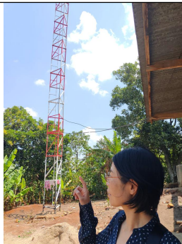
A Radio Tower