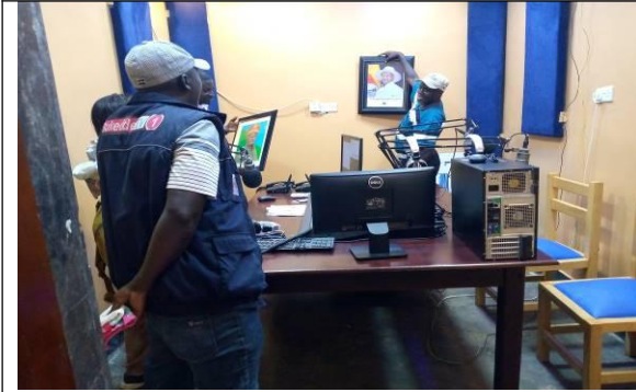
A visit to Luna FM

The team visited Luna FM studios but did not have time to make a speech regarding garbage management.