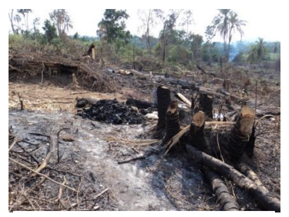
The once evergreen tropical rain forest on Kibalinga sub-county-Mubende

GBN will play the role of an agent to support the project called "Environmental Protection through Expanding Lemon Grass Growing and Education in Uganda" which SORAK conducts as environmental protection by growing lemon grass and income generation for 1 year from Apr 2017. This project will be implemented in sponsored by ERCA (Environmental Restoration and conservation Agency).