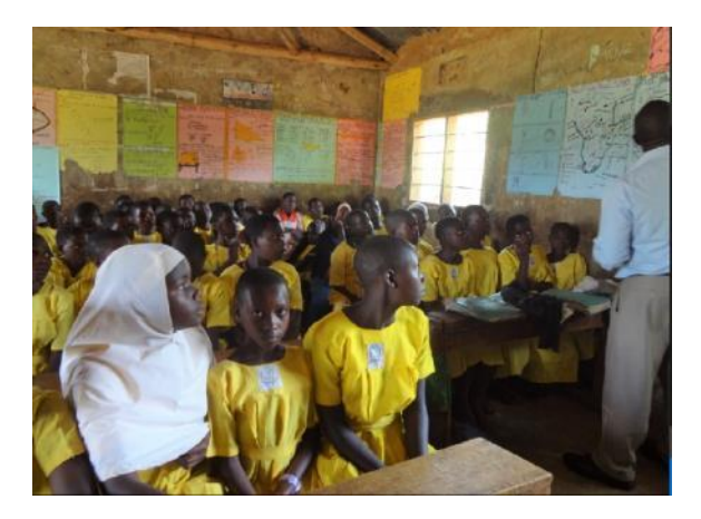
Class of menstruation atLwawuna Primary school in Mubende District Uganda.

This project will begin in April and its extension will be supported by LUSH JAPAN CO. LTD. and started from April, 2017.