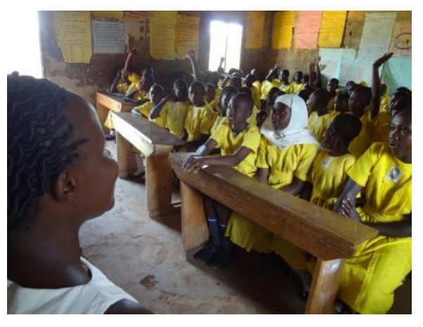
Girls share their views on Menstrual Hygiene Management challenges.