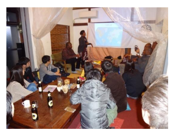
Ugandan lady presented about her country at African Night.

(Date: 18/12/2016 15:00 \sim 19:30 , Place: Yokohama, participants: Appropriately 30 participants)