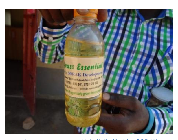
Lemon grass essential oil distilled by SORAK