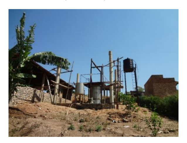
The distillation apparatus which SORKA has, and SORAK carries out lemon grass distillation into essential oil here by gathering lemon grass from