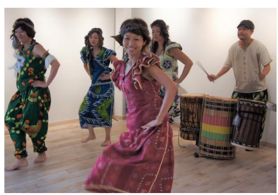
Drums and dancing (1)