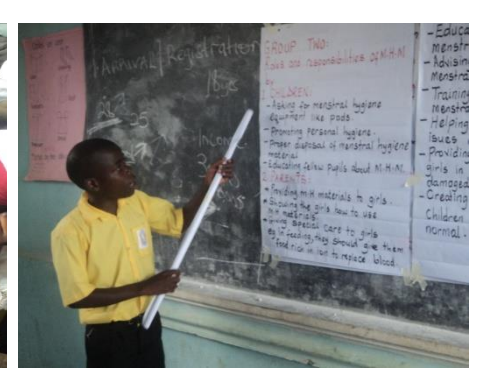
Boys presenting about their discussion