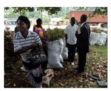
Lemon grass being purchased