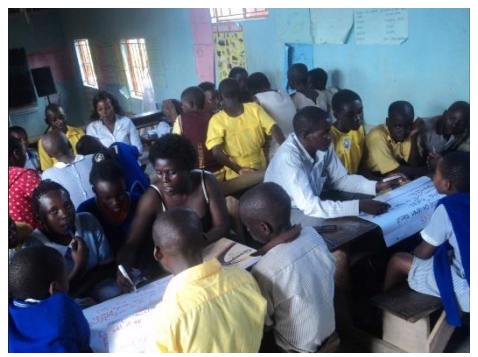
Discussions about their roles during menstruation period