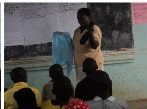
Lecture about how to use sanitary pads