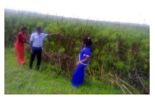
Field monitoring of land degradation