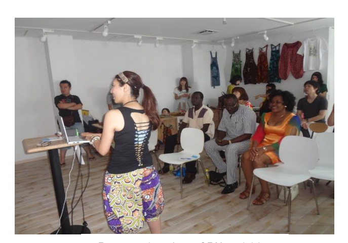
Presentation about GBN activities