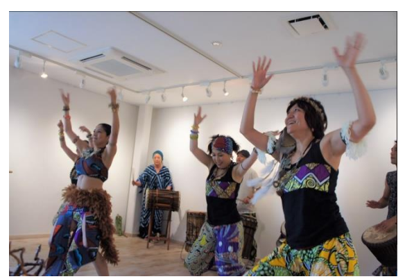
Drums and dancing (2)