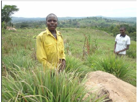
A youth who began cultivating lemon grass