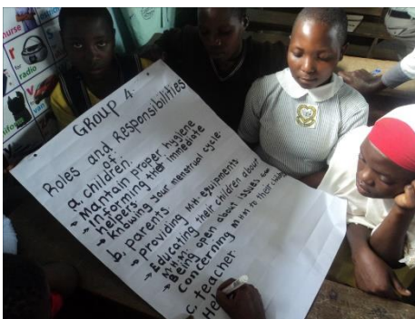
Group work to summarize the discussion