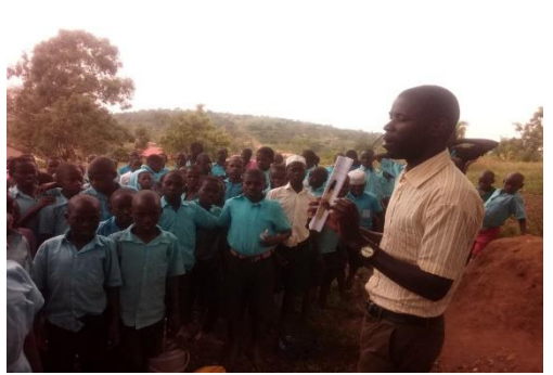
Environmental education for school children