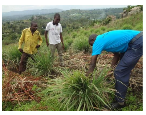
Teaching famers how to harvest lemon grass