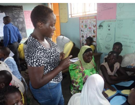
Training for making reusable sanitary pads