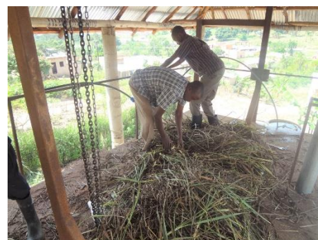
Distilling essential oil from lemon grass