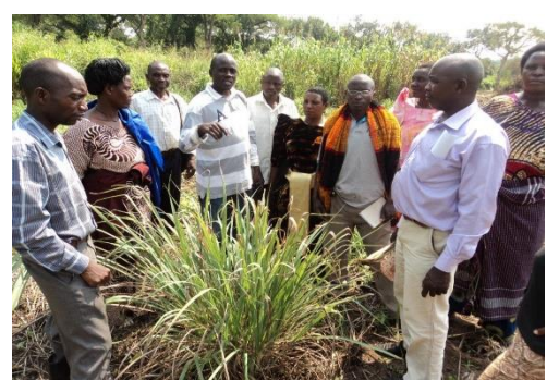
Environmental protection and lemon grass cultivation training for the youths