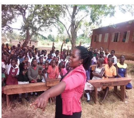
Hygiene management and g awareness explained at school