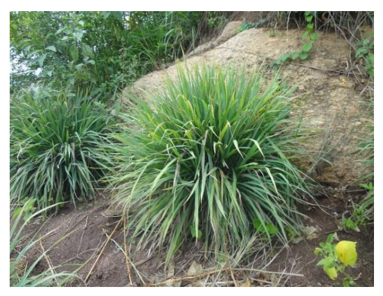
Lemon grass can grow among rocks.

As a result, lemon grass production has become an activity that is well accepted well by women, men and youth not only as a means to increase their income, but also as a