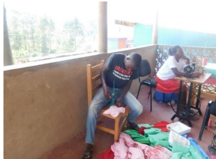
Reusable sanitary pads being produced