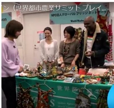
Selling goods at the booth

GBN participated in a two-day event, “World Market/The Urban Agriculture World Summit Pre-Event,” hosted by Nerima Ward (2019/11/24-25). GBN also set up a food booth at “Taste fatty tuna (bistro) Nerima vol. Printemps” hosted by Nerima Chiefs Club (2019/3/10)