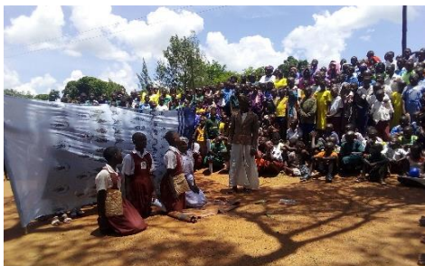
The club demonstrating the effects of environmental degradation through a short drama