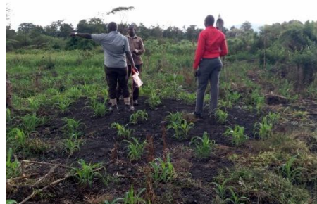
Environmental monitoring with the district environment officer.