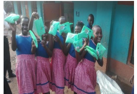
Students happy receiving “Happy Pads”