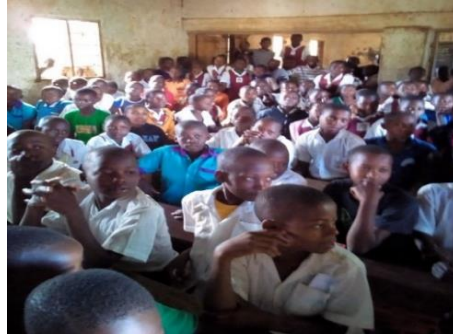
Students attending club member’s session