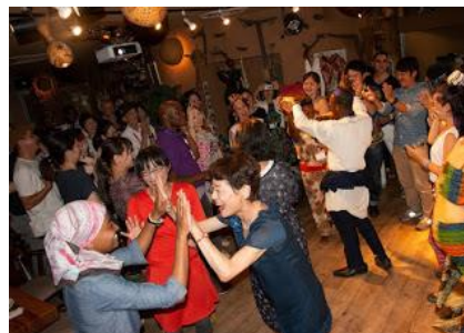
Participants and guests dancing to Ugandan music