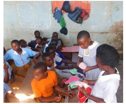
“Menstrual Hygiene management”