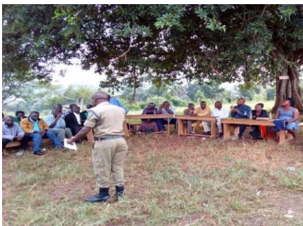
A police officer explaining environmental laws to the local residents