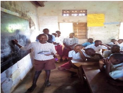
“Gender awareness and sex education”