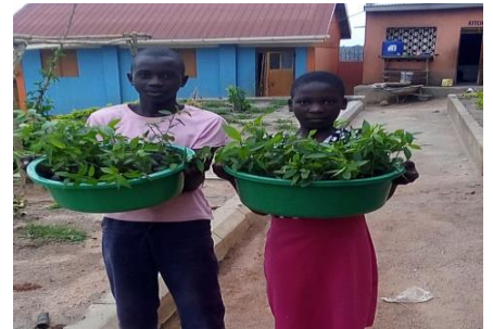
Students carrying the tree seedlings