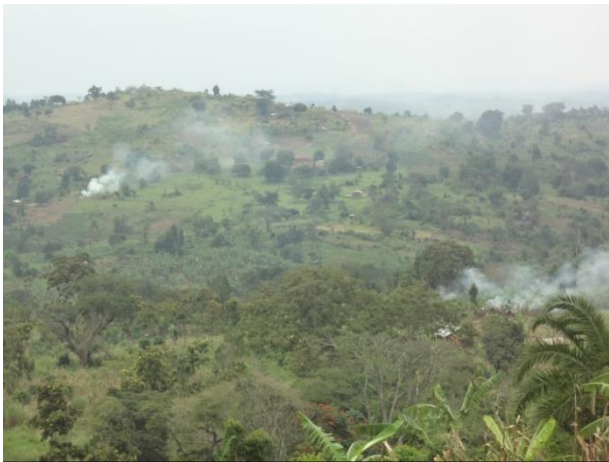
Burning the fields by the local

Uganda, in general, and Mubende district, in particular, have had persistent drought in the past a few years. This is due to human activities in search of arable land, which has led to severe deforestation, with associated burning as well as the most recent worst trend of wetland encroachment through unrestricted wetland reclamation. This is further attributed to high levels of unemployment especially among youth and women who form the majority of the Ugandan population. They lack an alternative means of survival/livelihood as they are tied to tilling of the land as well as use rudimentary technology that does not spare land to the detriment of environmental protection. This happens amid limited information and knowledge of the likely impact of unrestricted deforestation and wetland reclamation on climate change.