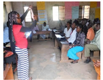
Awareness session for the parents and local resident