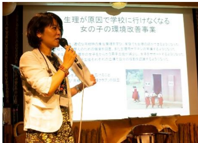
Introduction of GBN activities

(Date: 2018/6/9 18:30~21:30, Place: Hamamatsucho Tokyo, Participants: approximately 40)