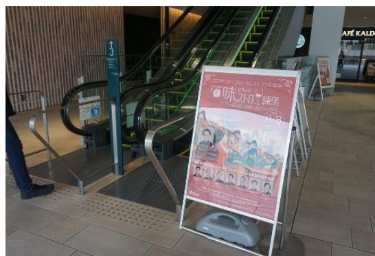
“Tasting delicious tuna (bistro)