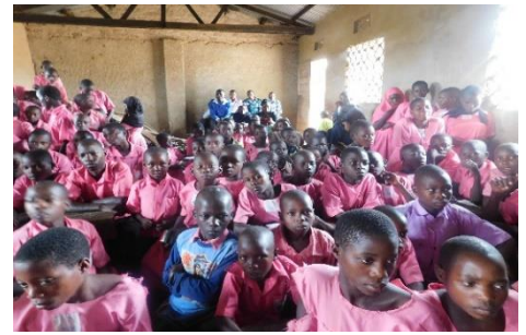
Students receiving environmental education and awareness rising training