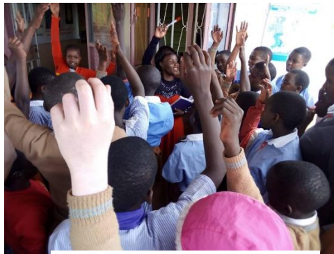
Selection of MHM club members