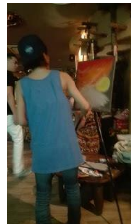
Live painting by TEEJ