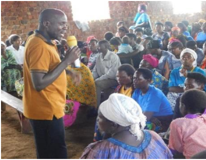
Training youth for environmental protection and lemon grass growing