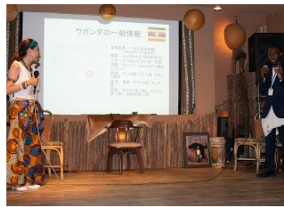
Introduction of Ugandan culture