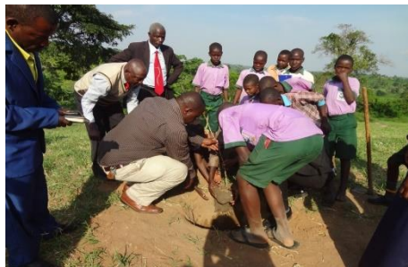
Planting trees activity by the environmental protection club