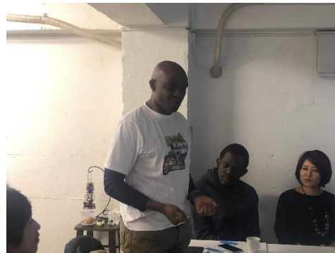
Answering questions from participants