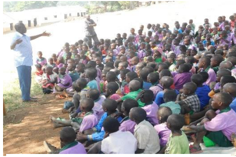
Training students in environmental education and awareness rising