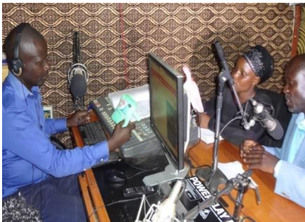
Rising awareness on the radio talk show