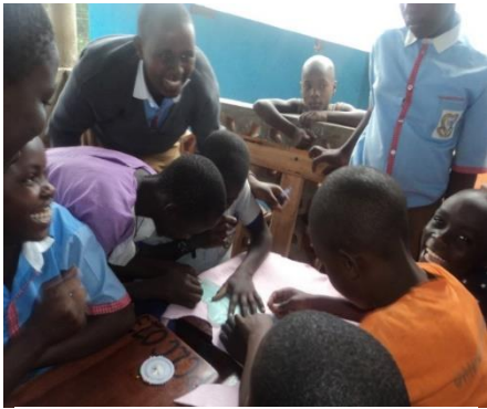
Training for making reusable sanitary