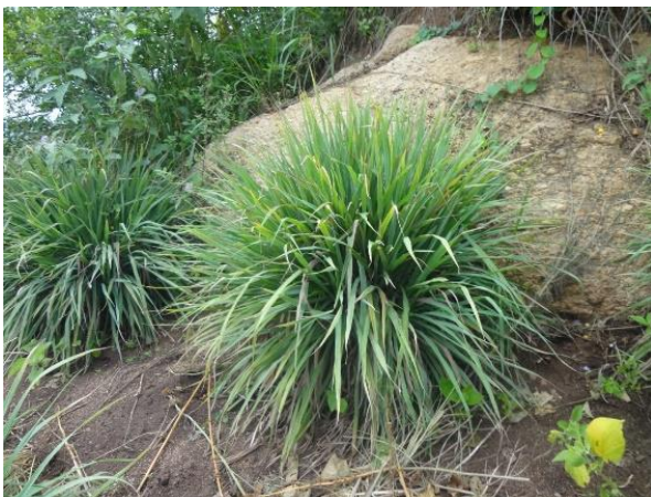
Lemon grass can grow among rocks

In order to combat these issues, GBN has started an environmental protection project through lemon grass cultivation the previous year, and SORAK has continued this project this year. Cultivating large amounts of lemon grass on barren land caused by drought prevents soil erosion and is anticipated to benefit the environment.