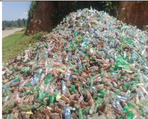
Plastics and bottles sorted and packed ready for transportation to Kampala