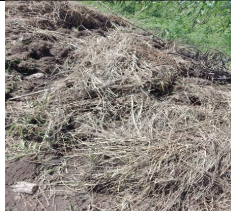
Decomposed garbage covered to decompose and be taken to the gardens