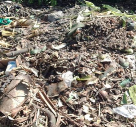
Decomposed garbage at the collection point and sorted from the non-decomposed ones