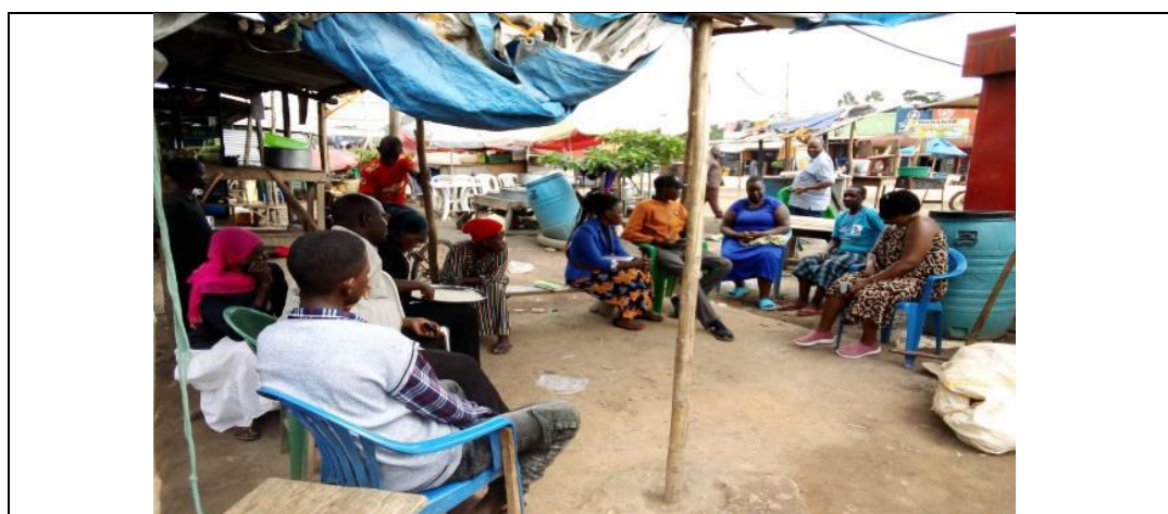
The photograph above shows the community based environmental protection and promotion group of Lusalira trading Centre established by this project.

This project has thanked for having established an environmental protection and monitoring group of 12 members. It is composed of; local women and men involved in petty trade, village leaders and subcounty leaders. This group was started way back in March-April 2022 in the earlier months of the project. It has been maintained and continues to operate as earlier planned. This group will maintain the project activities of cleaning Lusalira trading Centre even after December 2022 when the project ends. Every Thursday of a week has been earmarked as community cleaning/ monitoring day. This and the follow-up is being done by the local village local government while SORAK participates to provide a backstopping role.