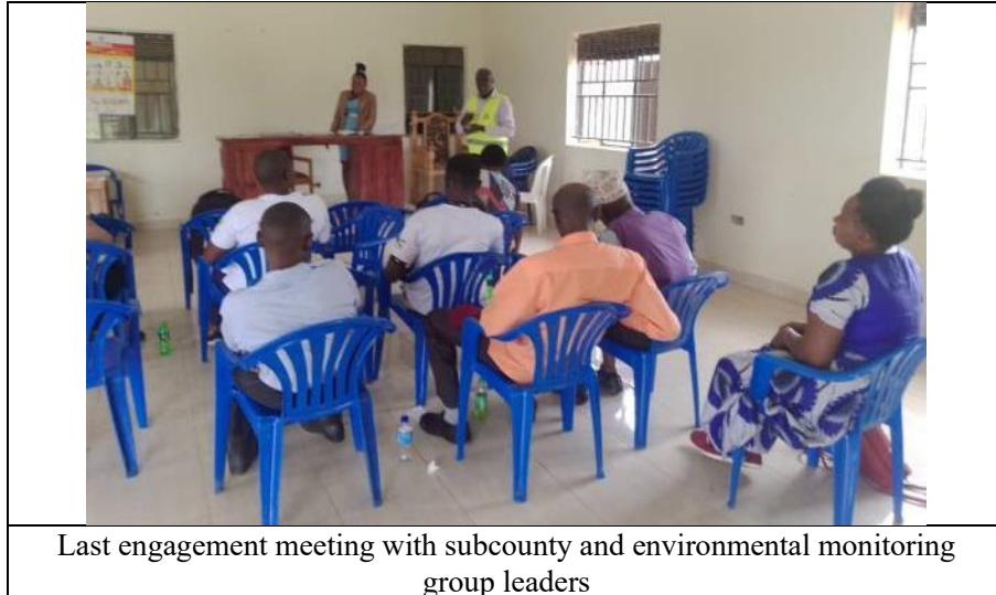
Last engagement meeting with subcounty and environmental monitoring group leaders