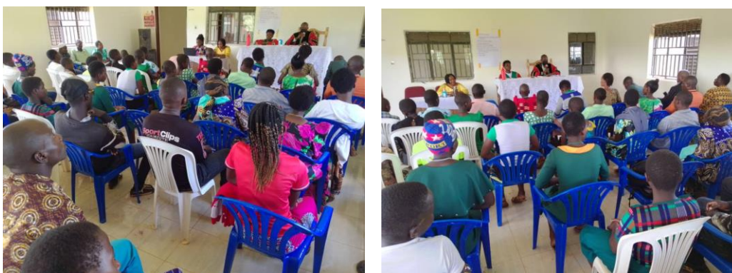
The sub county Chief, SORAK team, Speaker, Deputy Speaker, Chairman LC3 and other local leaders during the passing of the by-laws at the council

On 5 th /05/2022, the Subcounty Chief, Technical Planning Committee, SORAK team and the Local leaders conducted a council session to pass the by-laws for Garbage Management at Kibalinga subcounty hall. In the council various people attended including two monitoring committee persons to hear the passing of the by-laws. By-laws were passed on this day as indicated below in the annex.