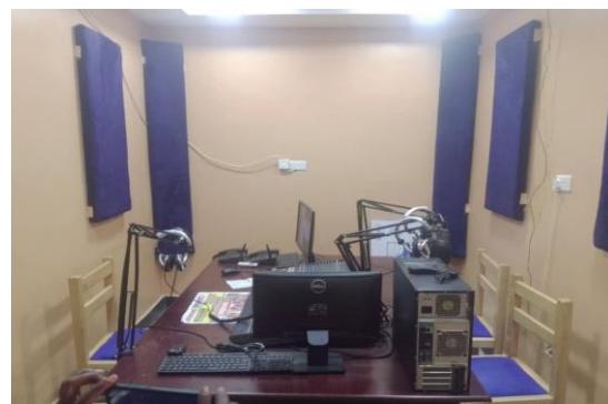
Radio Tower and the Radio system installed at the site