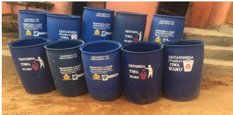
The 10 garbage containers to be stationed at the selected places where garbage will be disposed

The garbage containers (10) were procured and brought to office on the 30 th /05/2022 where they were kept for labelling, cutting off the top covers and branding. After this was completed, the Subcounty Chief was alerted to provide time for the stationing of the containers at the selected places which will take place on the 7 th July 2022.