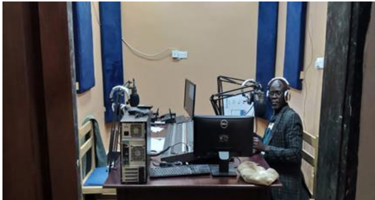
The Director during the Radio talk show at FM radio in Kibalinga on 24 th /06/2022.

In respect to the above activity, SORAK has conducted daily 30 minutes talks shows on LUNA FM. These are conducted between 8:30 to 9:00 pm. These are intended to create awareness about the use of the garbage containers. The director explained to the community about the availability of the garbage containers. Launching of containers was planned to take place on 7 th July 2022 and it will be headed by the Subcounty Chief who will officially place the containers to their destinations.