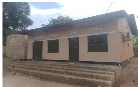
Inside and outside appearance of the house hosting the FM radio