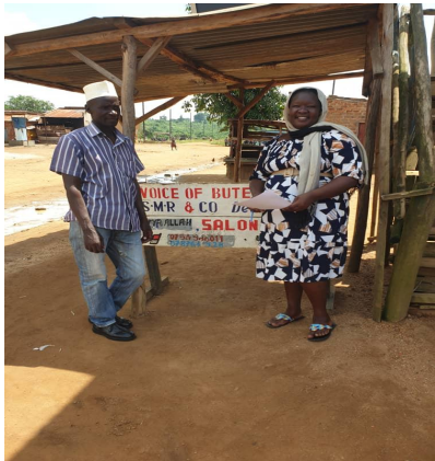
Some of the Votu members who attended the radio talk show

On the same date at 4.00pm still, we also conducted another talk show of one hour at Voice of Butende where the team leader encouraged and requested parents to support the girl child by availing them with materials to enable them make the reusable sanitary pads. In this same talk show he also raised the concern of how sexual reproductive health is important to both the boy and girl child and that shouldn't be undermined by both the parents and the community.