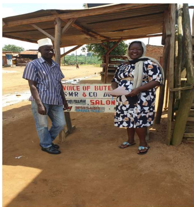
Some of the Votu members who attended the radio talk show

On the same date at 4.00pm still, we also conducted another talk show of one hour at Voice of Butende where the team leader encouraged and requested parents to support the girl child by availing them with materials to enable them make the reusable sanitary pads. In this same talk show he also raised the concern of how sexual reproductive health is important to both the boy and girl child and that shouldn't be undermined by both the parents and the community.