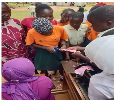
Some of Butende Umea pupils training fellow pupils after their training at the promotion centre.

At the promotion centre, we have managed to produce 370 reusable sanitary pads and to conduct pad making training for 31 trainers. More learners including adults have picked more interest in learning how to make the pads at the centre. In July, pad sales were not made. Meanwhile Butende learners have put more impact by spreading the pad making knowledge to their colleagues at school.