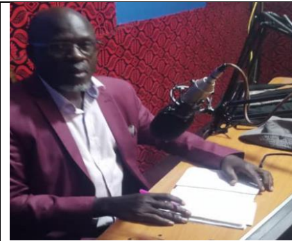
The Executive Director during the radio talk show at Tiger FM