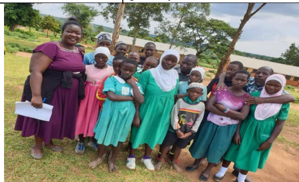
Lwamasaka MHM club group photo with VOTU