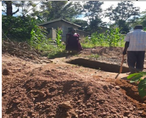
Construction pit latrine of Kitagobwa primary school