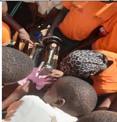
During their training using machines as well on how to make reusable sanitary pads (happy pad)