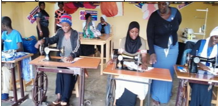
Trainees learning how to use the sawing machines at the training centre