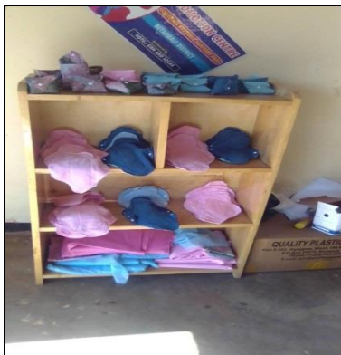
Manufactured pads at the Training centre

From the time of production VOTU has so far produced 1,556 reusable pads since March 2023 and it has sold 502 pads and donated 150 pads