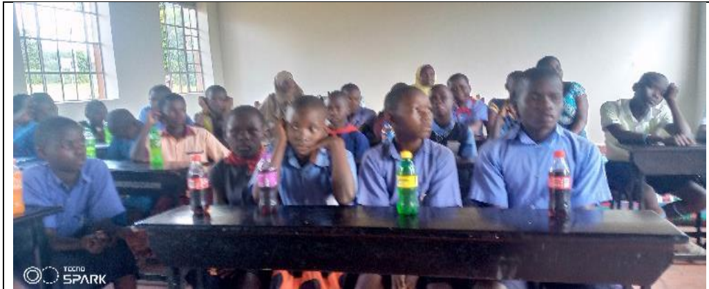
Participants during the learning the learning visit