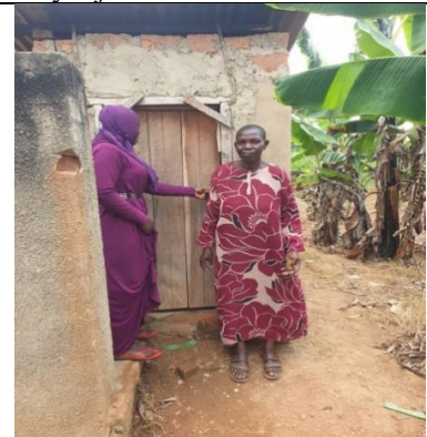
Monitoring of their changing rooms with senior woman in Butende primary school