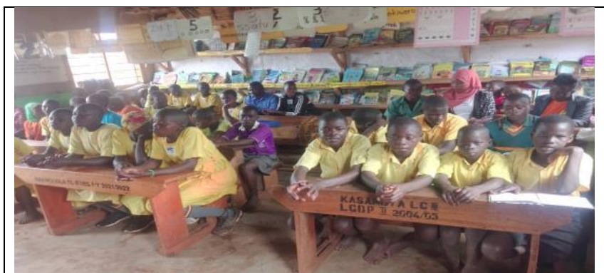
Participants during the learning the learning visit

In Mubende the learning visit was conducted on the 13/11/2023 where the schools converged at St Mary's Gwanika as one of the best schools in implementing the project activities. The session was conducted in a duration of two and half hours where the different Senior teachers from the respective schools shared their experiences in line with the project activity implementation for others to borrow a leaf. This was followed by the representatives of the MHM club members from the different schools who shared their experiences as members in a participatory manner. The total number of participants included 32 i.e., 12 female students, 9 male students, 9 female teachers and 2 male teachers. Worth noting is that Gwanika Primary School was selected to host the learning visit because their performance regarding implementation of the project activities is commendable.