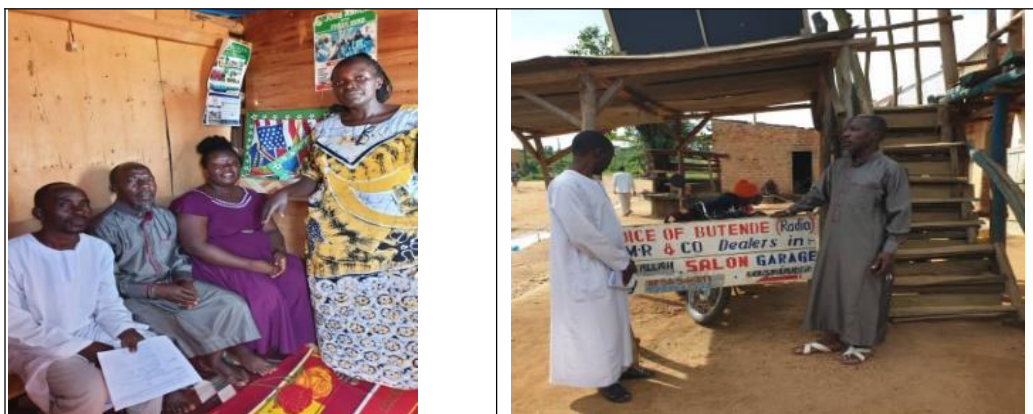
Radio Talk Show at Voice of Butende 28th April 2023

against menstruating girls. Community schools outside the target schools were called upon to prioritize menstruation hygiene. The team led by the team leader also reminded the community about the Happy Pad Promotion center and encouraged them to enrol for training program