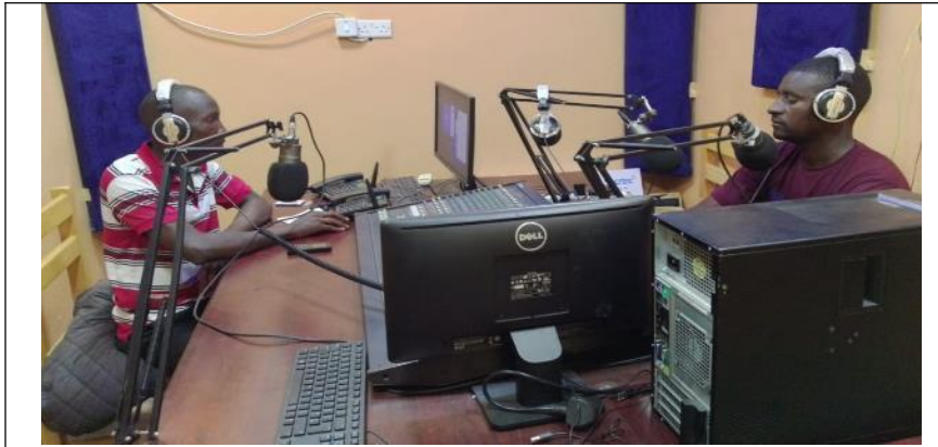
Project team sensitizing the community about the relevance of male involvement in MHM issues on the 3/April/2023

In Wakiso , a one hour talk show was conducted at Voice of Kiryagonja on the 6/April/2023 beginning from 7:00pm to 8:00pm in the evening. The participants included the Executive Director, projects manager and the Secretary for women Kiryagonja where the community was taken through the project overview and the achievements attained so far. Emphasis was put on the proper disposal of material used during menstruation and the availability of reusable sanitary pads at the Happy pad promotion centre. The secretary for women informed listeners about the responsibility of parents towards their children with emphasis on a girl child. Parents were encouraged to take their children to school.