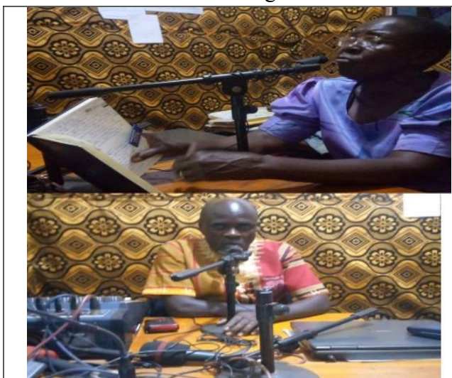
Radio talk show at voice of Kiryagonja

In Wakiso , a one hour talk show was conducted at Voice of Kiryagonja on the 6/April/2023 beginning from 7:00pm to 8:00pm in the evening. The participants included the Executive Director, projects manager and the Secretary for women Kiryagonja where the community was taken through the project overview and the achievements attained so far. Emphasis was put on the proper disposal of material used during menstruation and the availability of reusable sanitary pads at the Happy pad promotion centre. The secretary for women informed listeners about the responsibility of parents towards their children with emphasis on a girl child. Parents were encouraged to take their children to school.