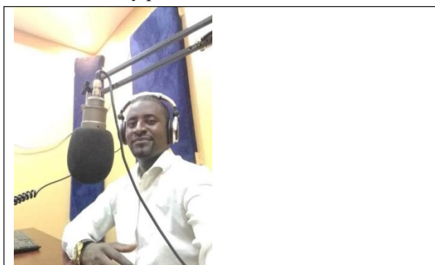
Project officer creates awareness about the roles of the different stakeholders towards Sexual and reproductive Health of the youths.

In Mubende , the talk show was conducted in a duration of one hour at Luna FM located in Kibalinga sub county on the 24 th /July/2023. Community members were reminded about their respective roles and responsibility regarding Sexual and Reproductive health of their children both girls and boys. Some of the key learnings from the fifth online session were also shared including limited access to appropriate information regarding SRH to the religious leaders which prevents them from prioritizing such issues while they interact with their followers, the need to get age-appropriate information for the children by parents and teachers in line with SRH among others.