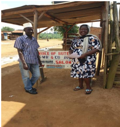
Some of the Votu members who attended the radio talk show

On the same date at 4.00pm still, we also conducted another talk show of one hour at Voice of Butende where the team leader encouraged and requested parents to support the girl child by availing them with materials to enable them make the reusable sanitary pads. In this same talk show he also raised the concern of how sexual reproductive health is important to both the boy and girl child and that shouldn't be undermined by both the parents and the community.