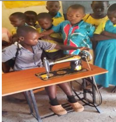
Pad making session at Kasasa P/S