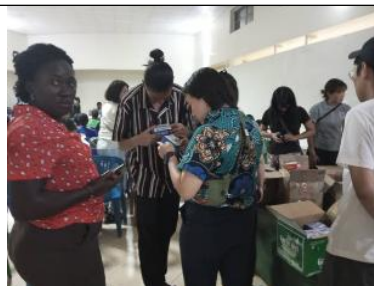
JICA members examining the packaging of the Happy Pad produced by VOTU