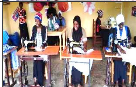
Skilling trainees at the promotion center in Butambala.