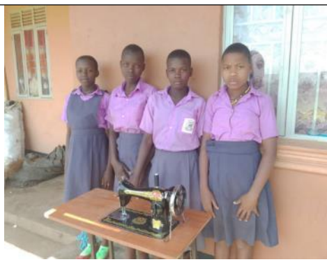
Kabowa P/S MHM club members