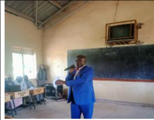
SORAK executive director speaks to parents