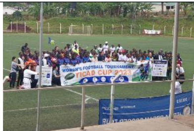
TiCAD CUP 2023

This was a very milestone given the number of over 48 participants that received our good message of the happy Pad that we think is spreading all over. These have become our brand ambassadors of the Happy Pad.