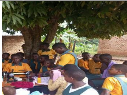
Pad making session at Kiyita P/S