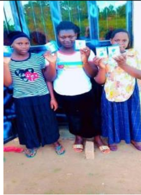
Some of the selected trainees displaying the reusable pads.