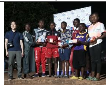
VOTU, JICA with some of the participants of TiCAD Tournament after receiving happy pads