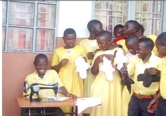
Pad making session at Gwanika P/S