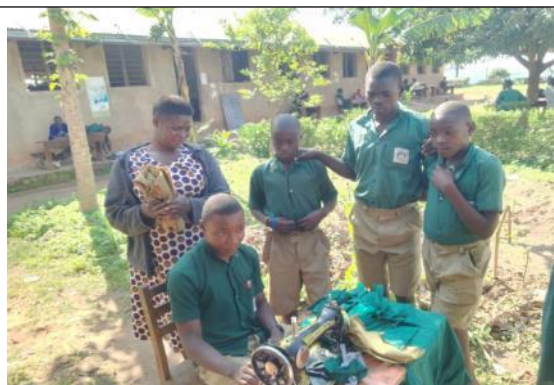
Pad making in progress at CAWODISA P/S