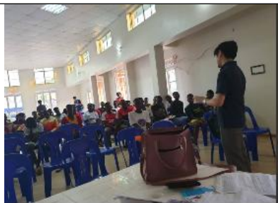
JICA member addressing the tournament participants during the MHM talk show