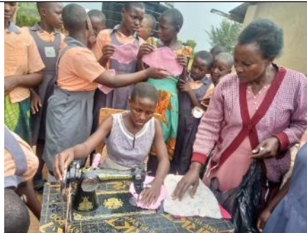
Pad making session at Ikula P/S