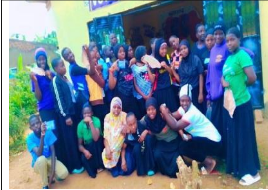
Trainees exhibiting finished re-usable pads