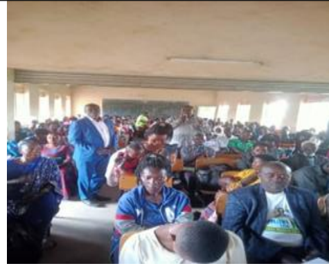
A parent reacts after the presentation