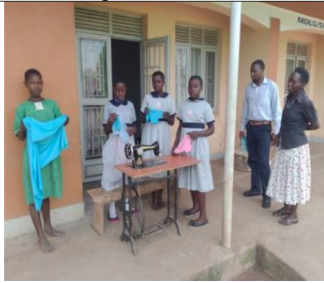
Pad making session at Katega