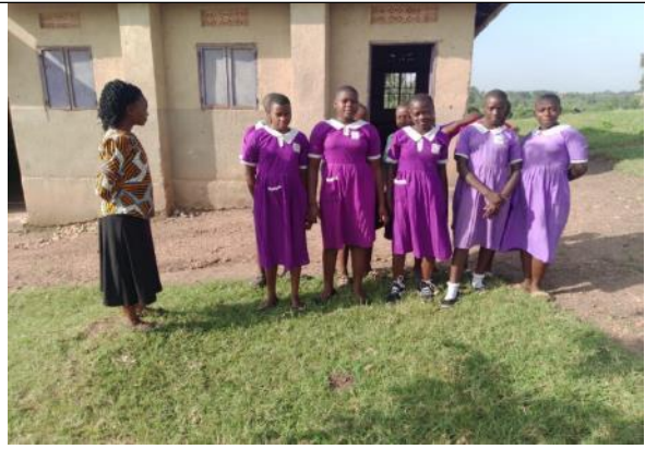
MHM Club members at Christ the King during the counseling sessions