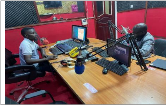
The Executive Director during the radio talk show at Tiger FM