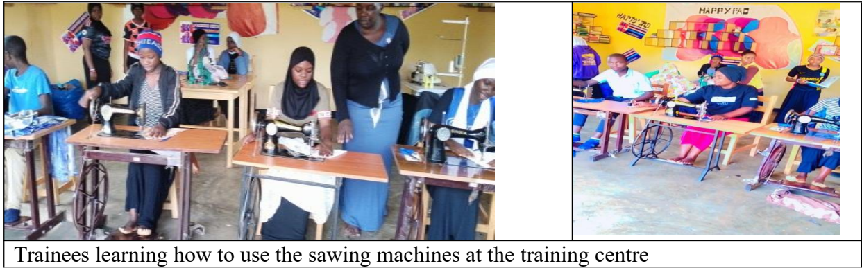
Trainees learning how to use the sewing machines at the training centre