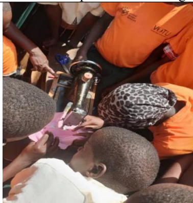
During their training using machines as well on how to make reusable sanitary pads (happy pad)