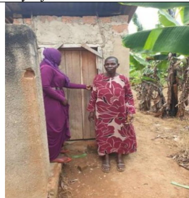
Monitoring of their changing rooms with senior woman in Butende primary school