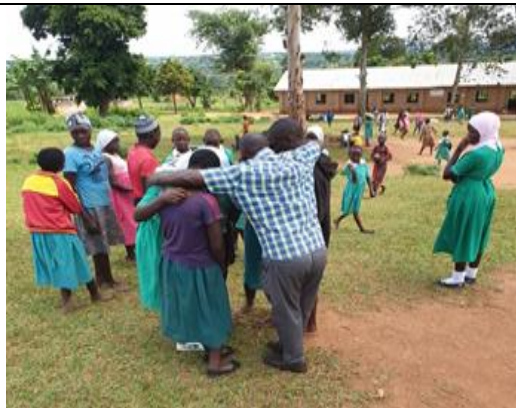
Team leader of VOTU with the pupils during break time.