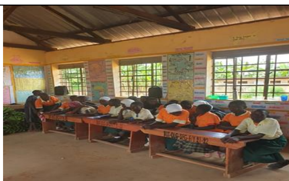
MHM club members of Butende Umea during an MHM session.