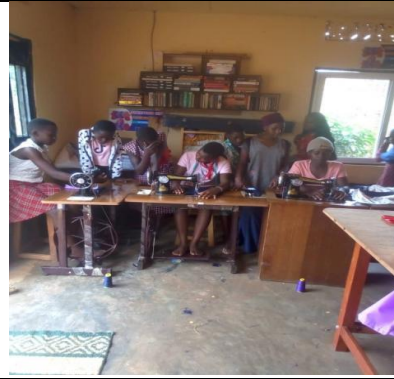
Nakato showing the trainers how to make and sew pads using the sewing machines