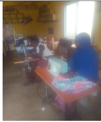
Trainers sewing pads