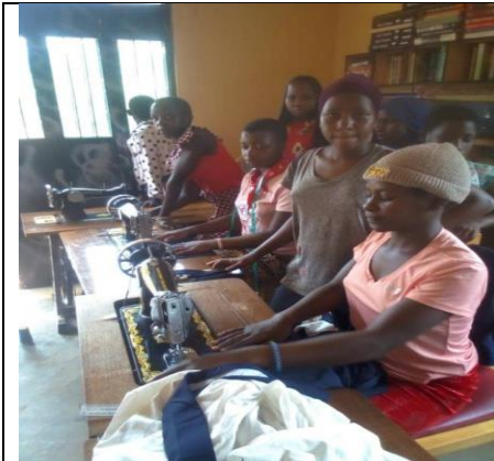
Trainers learning how to make pads