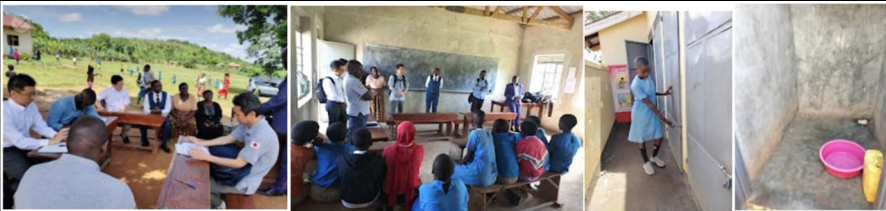
◆ Kitanda Primary School: Experienced a head teacher transfer. The outgoing head teacher effectively briefed the current head teacher about the project, demonstrating a model for sustainability and continuity despite teacher transfers.