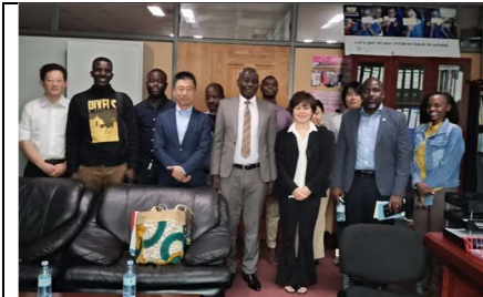
Ministry of Education and Gender unit members

In a meeting with the Director Basic Secondary Education, highlighted the importance of girls' hygiene and the project's crucial role in addressing it. While acknowledging the need for broader MHM education in the national curriculum, they noted current limitations in government resources and urged GBN and JICA to continue their partnership, emphasizing the key role development partners play in ensuring the success of MHM and gender awareness initiatives. The ministry also introduced the team to the Gender Unit , where a brief meeting led to an invitation to join the technical working committee to better understand potential avenues for collaboration.