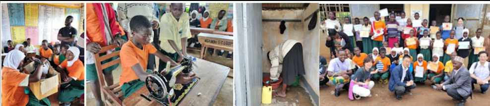
◆ Bule Umea Primary School: Exemplary school with a refurbished changing room.