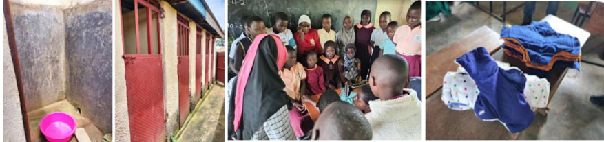
◆ Kiroro Primary School: Progress hindered by administrative challenges and extreme weather damaging buildings.