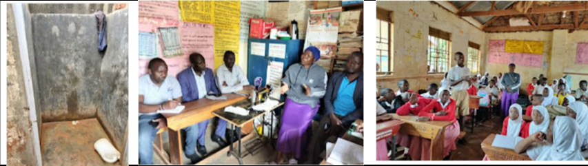
◆ Maganjo Umea Primary School: Challenges with organizing a large student population for activities and maintaining the changing room.