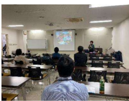
At the seminar

On February 27th 2024, we participated in “SDGs Multicultural CITY Forum” and explained the above-mentioned project in Uganda to the general public. Since it was only for the face to face participation, unfortunately not many people could join but having a few people enabled us to receive more questions and have enough time to explain the overview, objectives, and challenges of our project. As this lesson learnt, we would continue to work on publicity to deliver announcement of our events to more people interested in our activities.