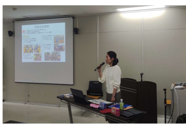
Responding to the questions from the participants