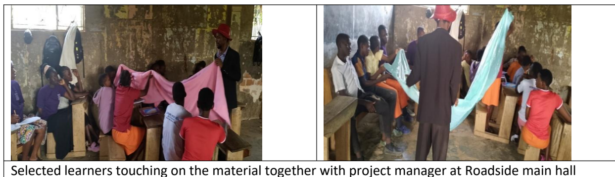
Selected learners touching on the material together with project manager at Roadside main hall

This project intends to provide 60 adolescents both boys and girls aged' 12 to 18 and other 20 community women aged' 19' to 40 with knowledge information and skills to make reusable sanitary pads in order to change their lives and sustaining them while at school. Due to inadequate machines we decided to train 9 girls and 3 boys from school and 4 community members perfectly. these will train fellow pupils and other community members to ensure project sustainability and tenure.