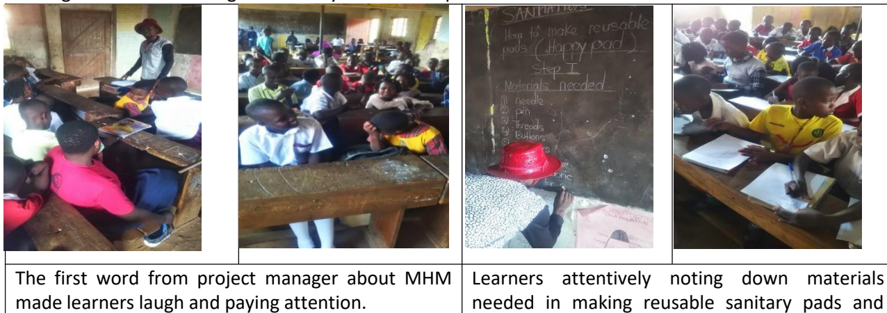
The first word from project manager about MHM made learners laugh and paying attention.

On the above date we conducted the first day sanitary pad training at Roadside Primary school, we went through the entire training successfully as shown in pictures below