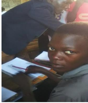
Some of our team members actively participated in pad measurements together with learners for project sustainability.