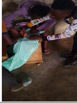
After sketching a reusable sanitary pad shape, learners are tracing it on materials given.