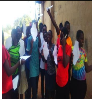
Excitement among learners after final cutouts from measurements followed on papers.