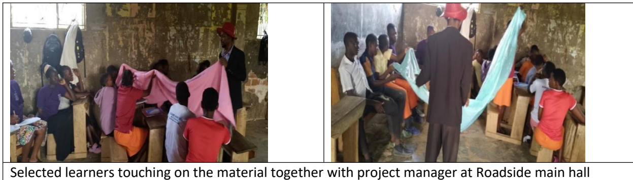
Selected learners touching on the material together with project manager at Roadside main hall

This project intends to provide 60 adolescents both boys and girls aged' 12 to 18 and other 20 community women aged' 19' to 40 with knowledge information and skills to make reusable sanitary pads in order to change their lives and sustaining them while at school. Due to inadequate machines we decided to train 9 girls and 3 boys from school and 4 community members perfectly. these will train fellow pupils and other community members to ensure project sustainability and tenure.