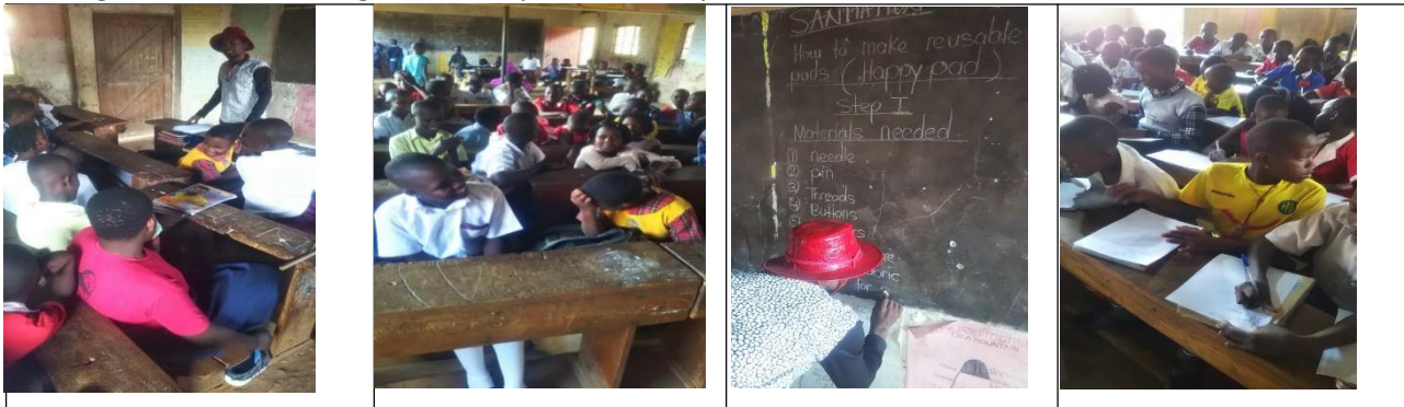
The first word from project manager about MHM made learners laugh and paying attention.

On the above date we conducted the first day sanitary pad training at Roadside Primary school, we went through the entire training successfully as shown in pictures below