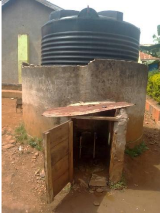
One of the water facility at Sam Iga Memorial Primary School