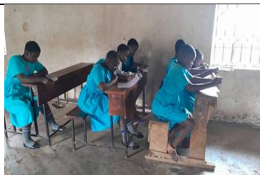
Students (girls) of Jinja Kalooli Primary School answering the questionnaire