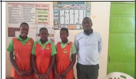
Students of St. Charles Lwanga after answering the questionnaire