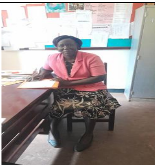
Head teacher St. Charles Lwanga during her interview