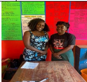
Interview with Headteacher Kiwenda SDA Primary School in Busukuma Division