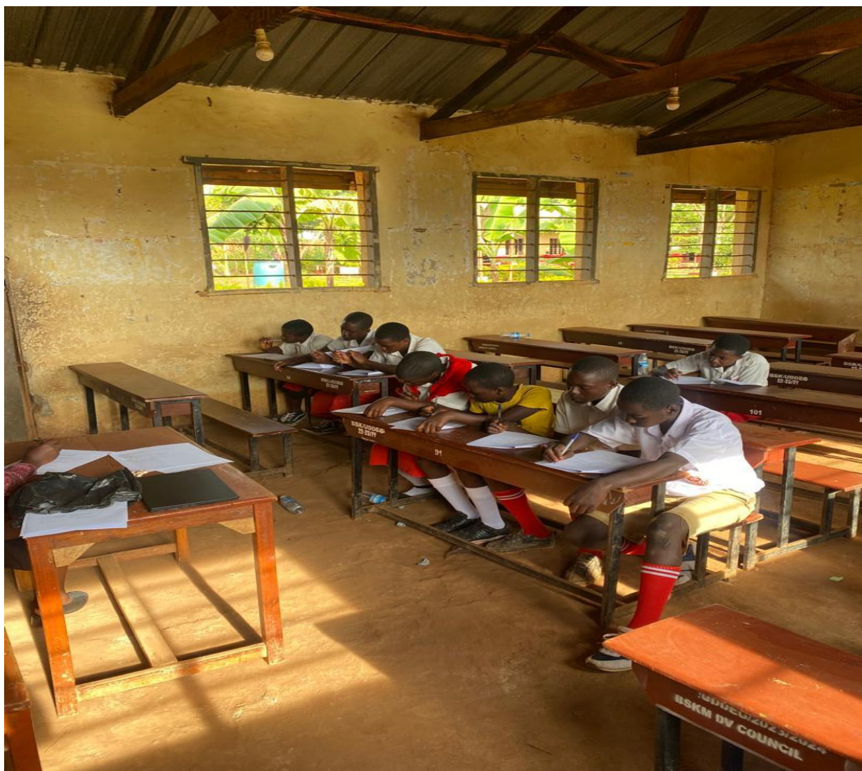
Students of Kiwenda SDA during the assessment exercise

The Project ‘Support the Introduction of School Menstruation Hygiene Management (MHM) under Local Government for a Girl-Friendly Educational Environment.’