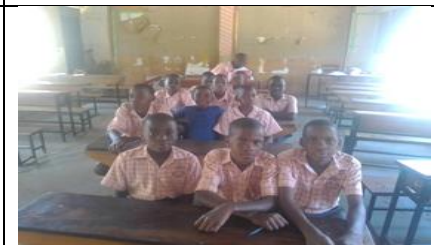
Students of Sam Iga Memorial Primary School just after answering the questionnaire