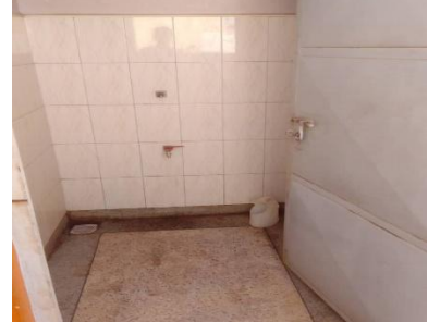
Changing room for girls at Nansana Catholic Primary School, it was in a very good condition because they received support from “Cheishire”