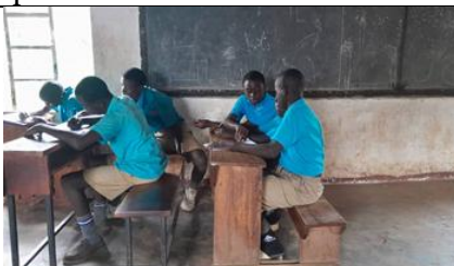
Students (boys) of Jinja Kalooli Primary School answering the questionnaire