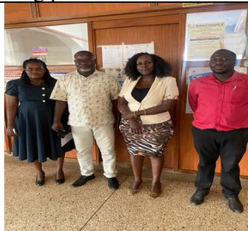
Municipality Officers and GBN staff after conducting the questionnaire assessment.