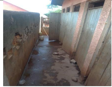
Inside the toilet facility at Sam Iga Memorial Primary School