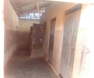
Toilet facility at Nansana Catholic Primary School