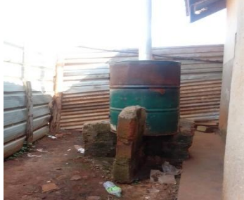
Man-made incinerator at Nansana Catholic Primary School