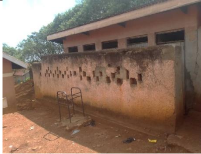
Toilet facility at Sam Iga Memorial Primary School