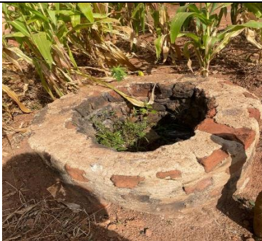
Dust bin at Kiwenda SDA Primary School