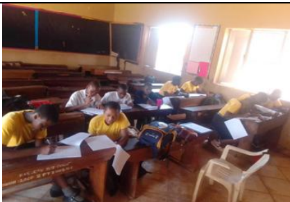
Students of Nansana Catholic Primary School answering the questionnaire