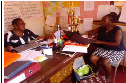
Interview with Headteacher Nansana Catholic Primary School in Nansana Division