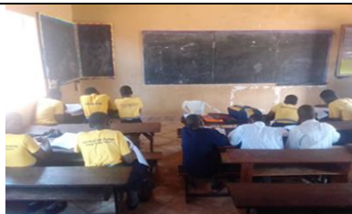
Students of Nansana Catholic Primary School answering the questionnaire