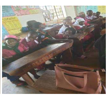
Kitagobwa at their wing