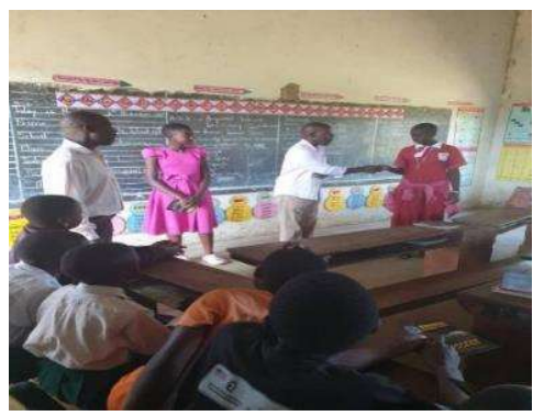
Both teams receiving their awards (Nkokooma and Kitagobwa)

Within these six school's competitions, we have fixed them together with their questions above: