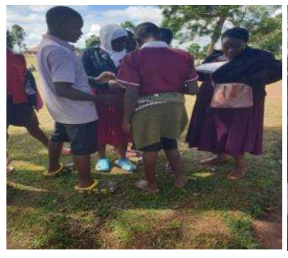
Kitagobwa prepares for competition