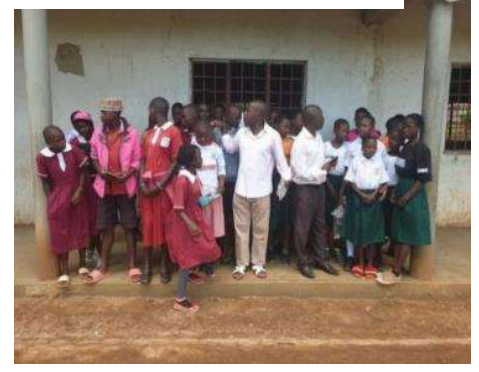
Group photo of both teams (Nkokooma and Kitagobwa)