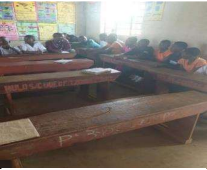
Team of Nkokooma at their wing