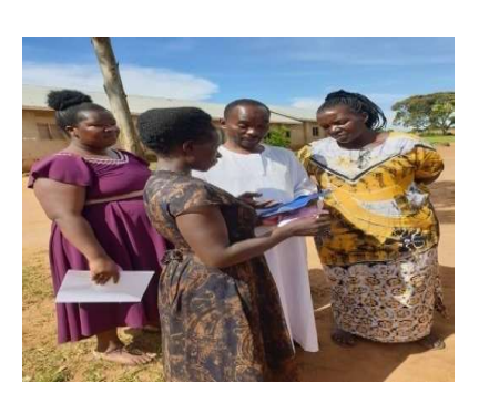
MHM club at Nawango primary school