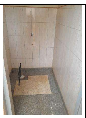
Washroom at Jinja Karoli p/s