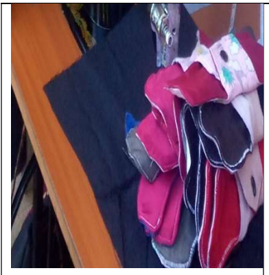
Pads produced at St.Mary's Gwanika