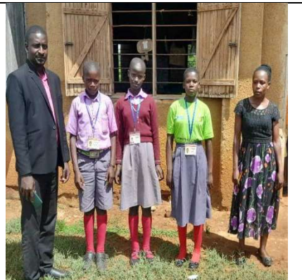
MHM club leaders at Kabowa P/S