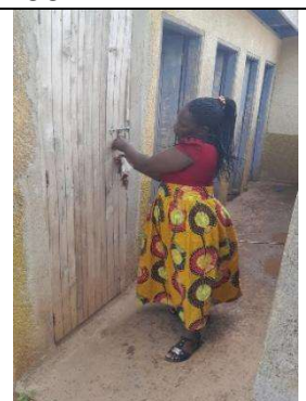
Washroom at Kitungwa c/u