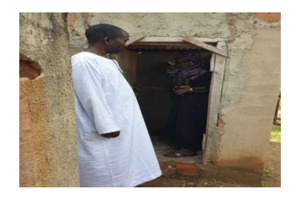
washroom at Lwamasaka