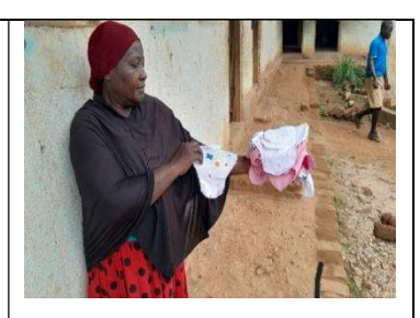
Senior lady displays cut pieces of pads yet to be sewed.

The learners seem to be enjoying pad making and the pads look neater than before since they are now made using a sewing machine and not by hand like before.