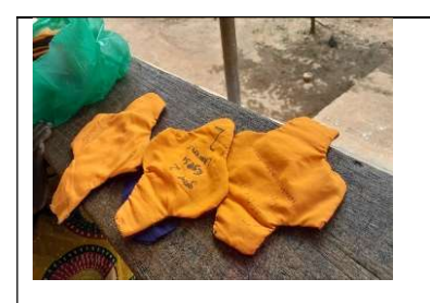
Pads produced at Kitungwa C/U with names written on them