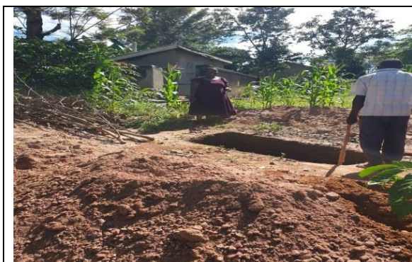
The pit latrine is under construction in Kitagobwa CS

I am really happy to say that Kitagobwa has been blessed to make another toilet constructed. They are just digging the pit. This is because their toilet has been fallen for quite long period of time so they were not using their washrooms ever since and now the changing room will also be connected on this new structure.