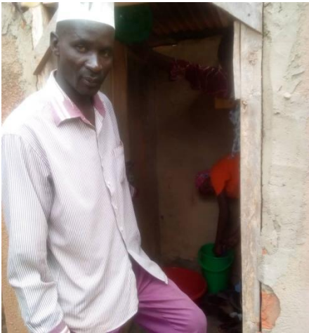
Kayenje primary school washroom Clean and having enough materials

Kayenje has put more effort to train and sensitize other teachers over the project so as to raise the motivation among the school teamwork since this school is overwhelmed by cathedral religious norms and its population is highly noted which had led them to become out of hands with sanitation within their washrooms. Now is a gone case ever since we advised them over it.