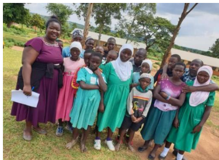
Lwamasaka MHM club group photo with VOTU