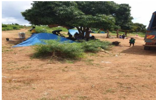
All materials at school for making them source of water.