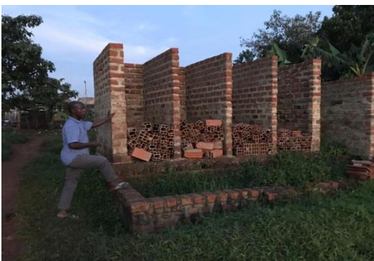
Nkokooma primary school new latrine

This time round they are also going under the construction of new Latrine which they promised to consider the raise of the wall for changing room onto the new look of their washroom.