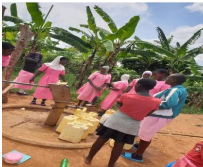
Pupils at the distant borehole where they used to get water.