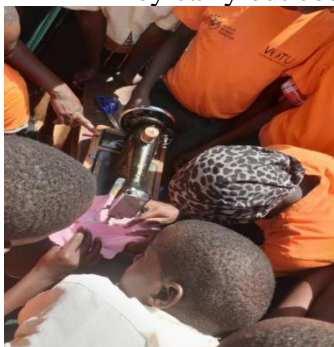
During their training using machines as well on how to make reusable sanitary pads (happy pad)