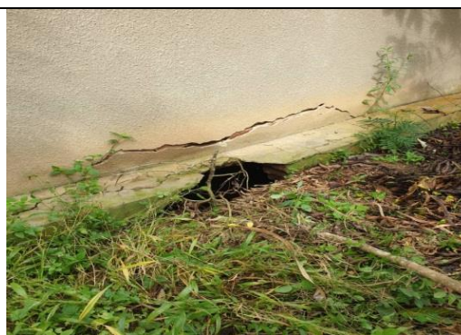
The old pit latrine that collapsed