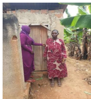
Monitoring of their changing rooms with senior woman.