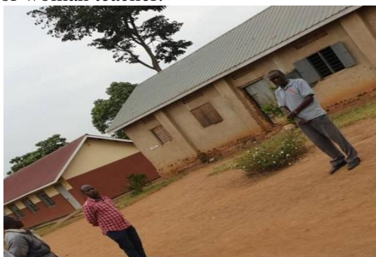
The head teacher of Butalunga sharing with team leader over the issues mentioned above.